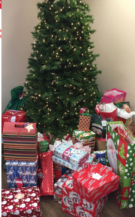
Calvary's Giving Tree with 300+ ornaments is possible through the Adopt-A-Family program at our local United Way.