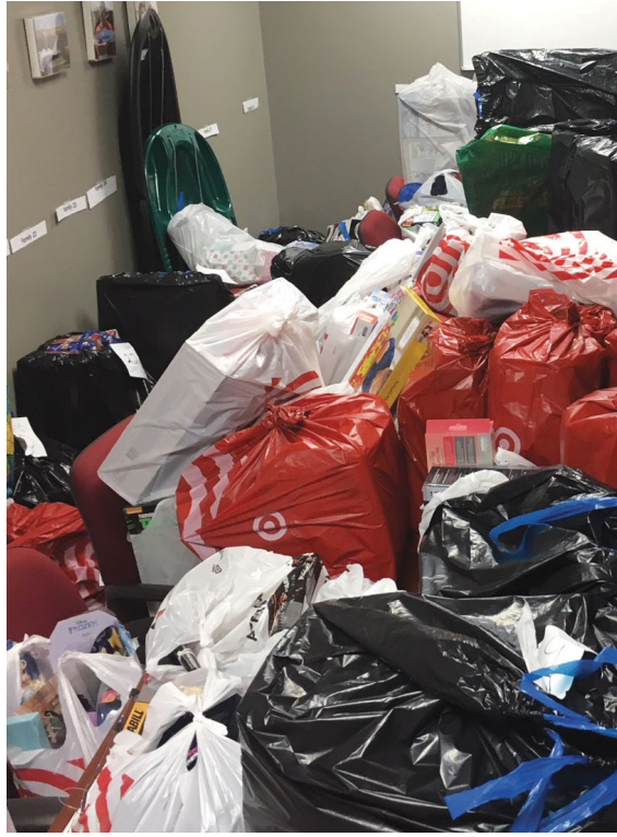
Gifts are collected at the United Way office where families pick them up.